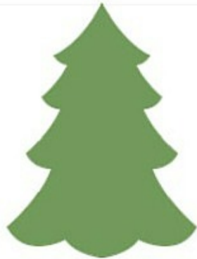
a tree that doesn't lose its leaves